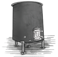
3% concrete fermentation

Fact of Note: Aged in 18% foudre for 18 months.